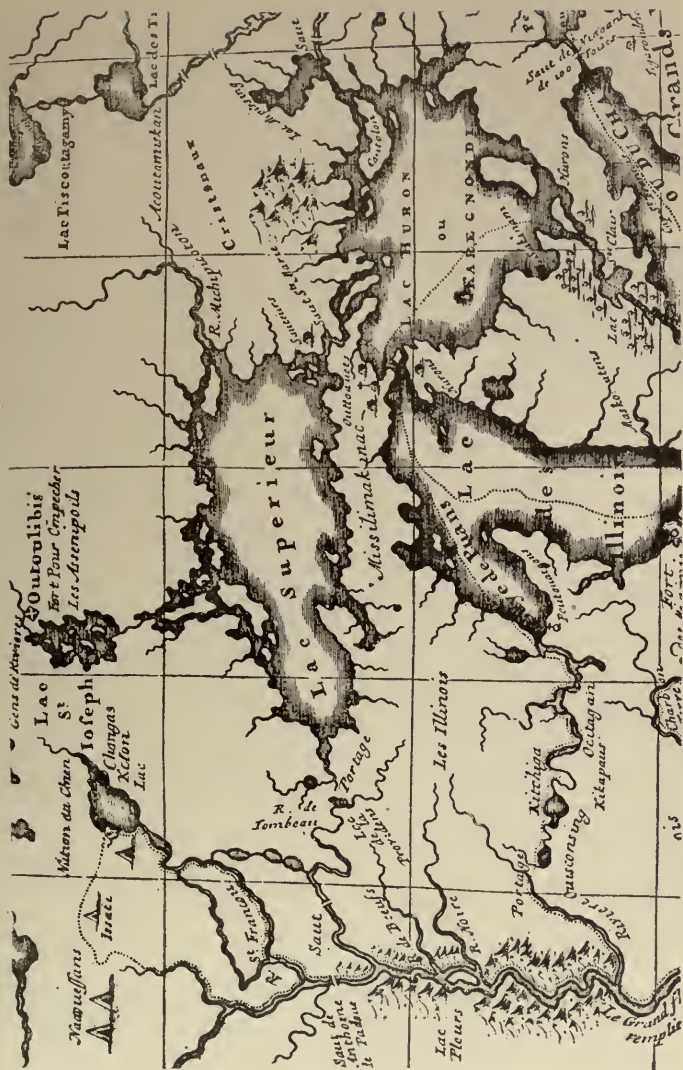
FATHER HENNEPIN'S MAP OF THE UPPER LAKES, 1697.